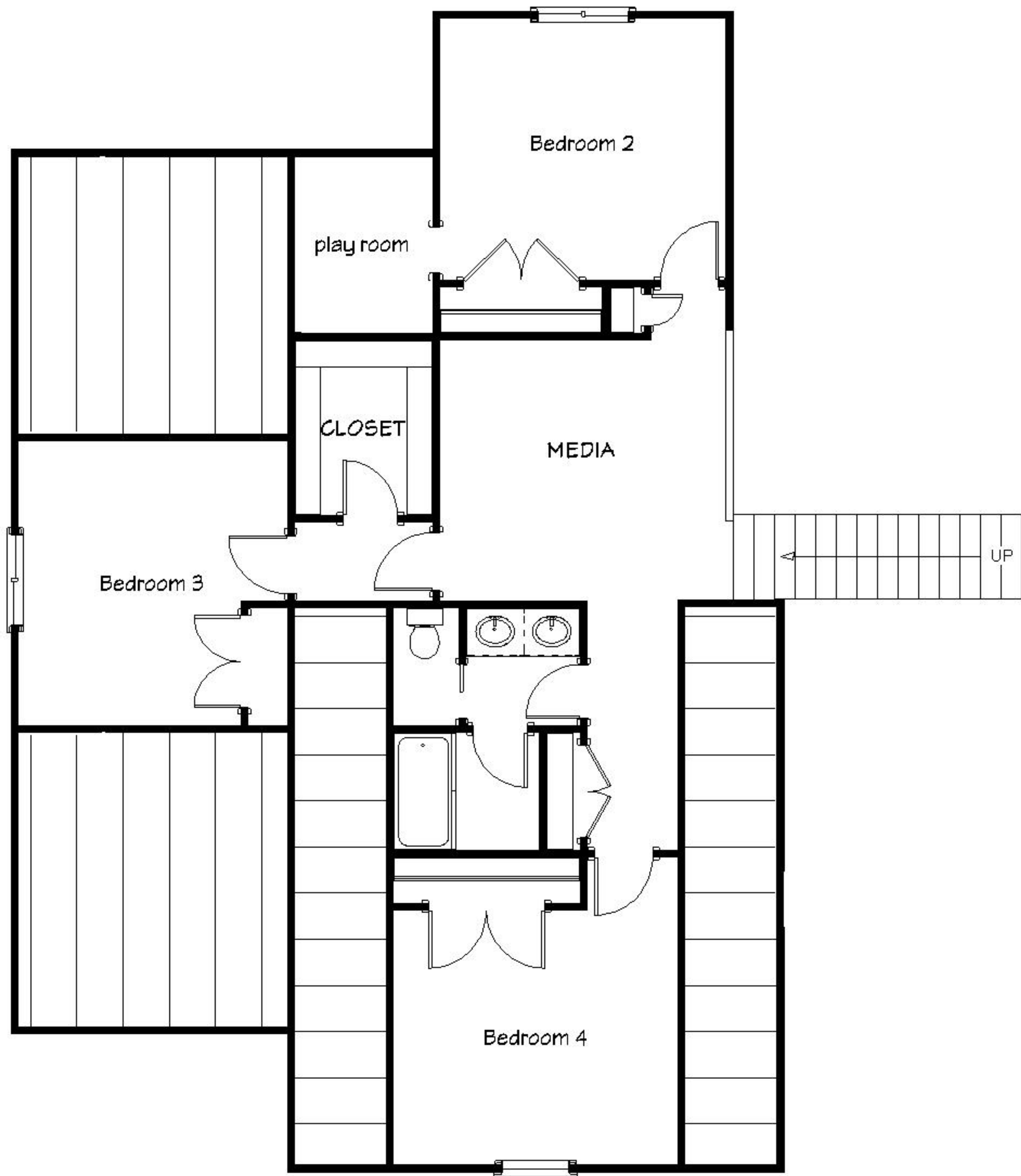
UPPER FLOOR 938 Square Feet