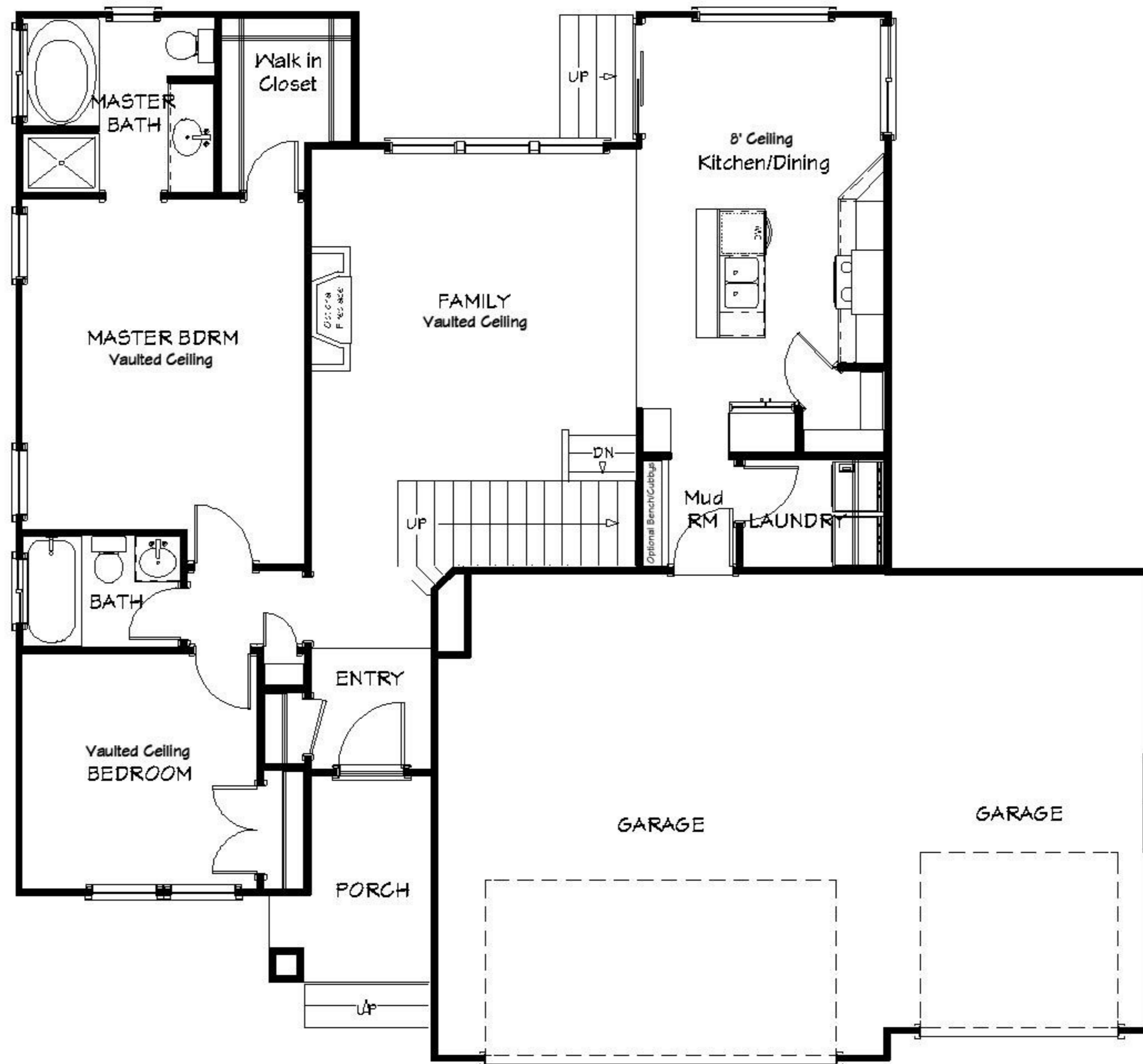
MAIN FLOOR 1208 Square Feet Width: 52 Depth: 48