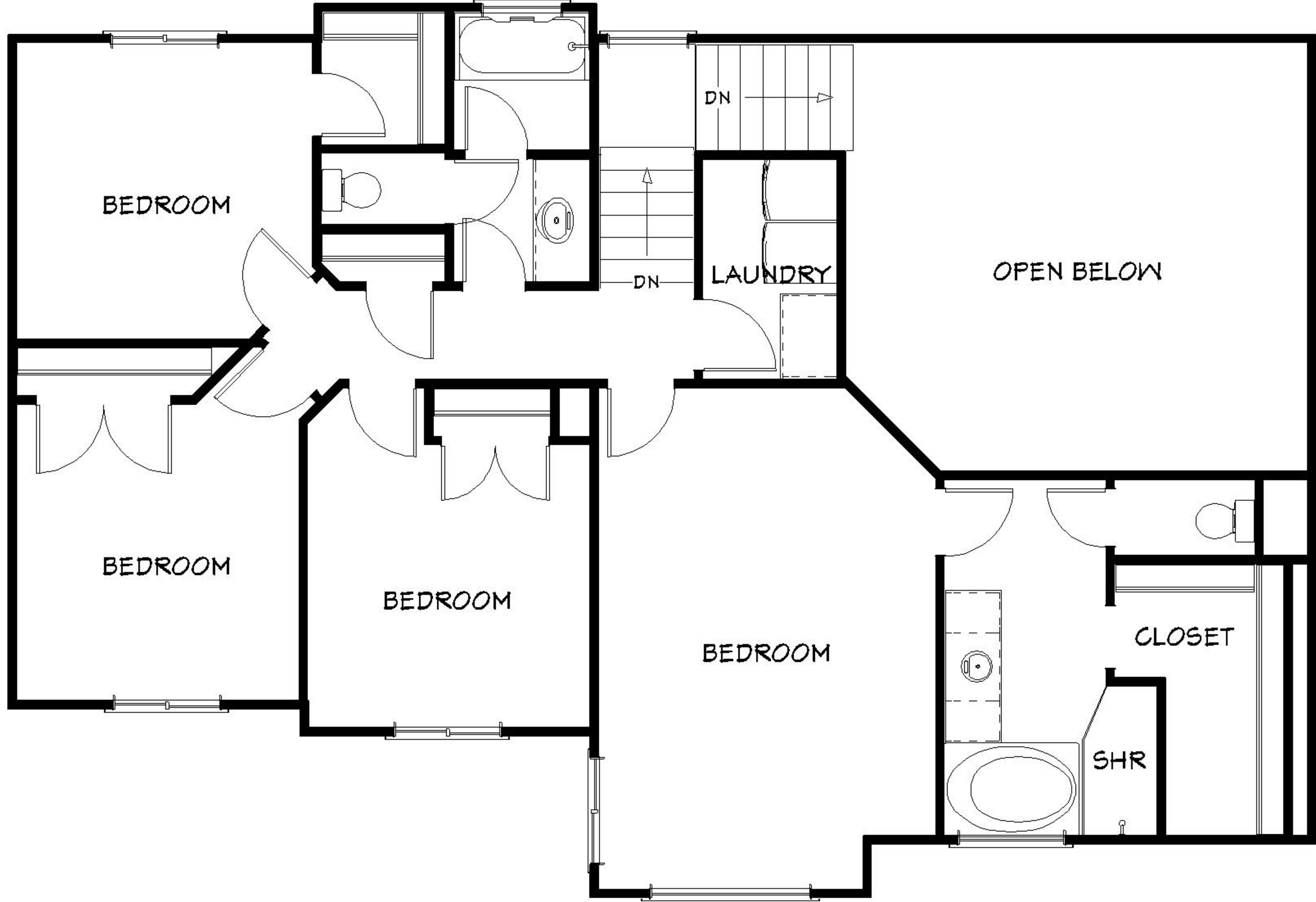
UPPER FLOOR 1025 Square Feet