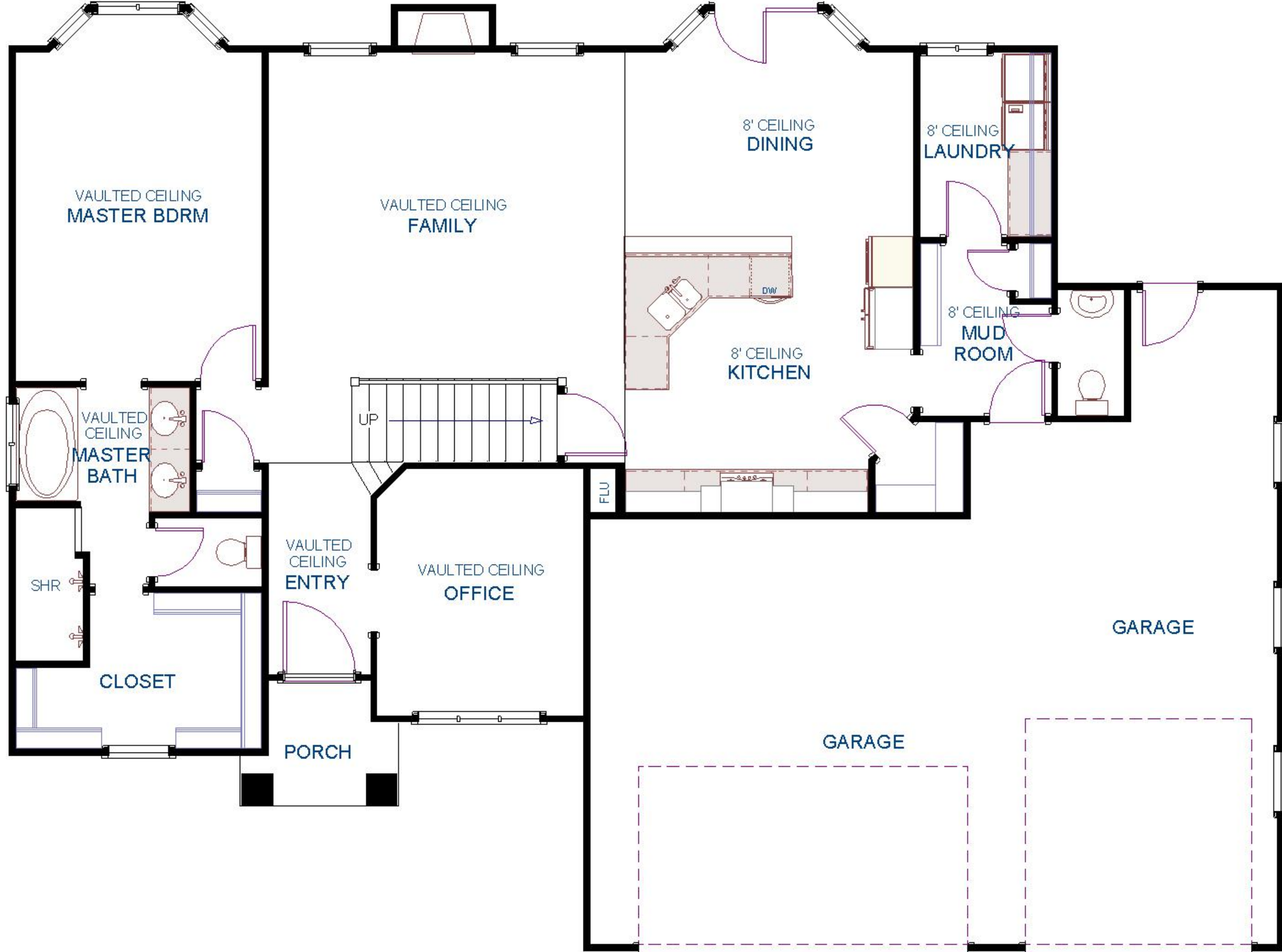
MAIN FLOOR 1490 SQUARE FEET WIDTH: 62' DEPTH 44'