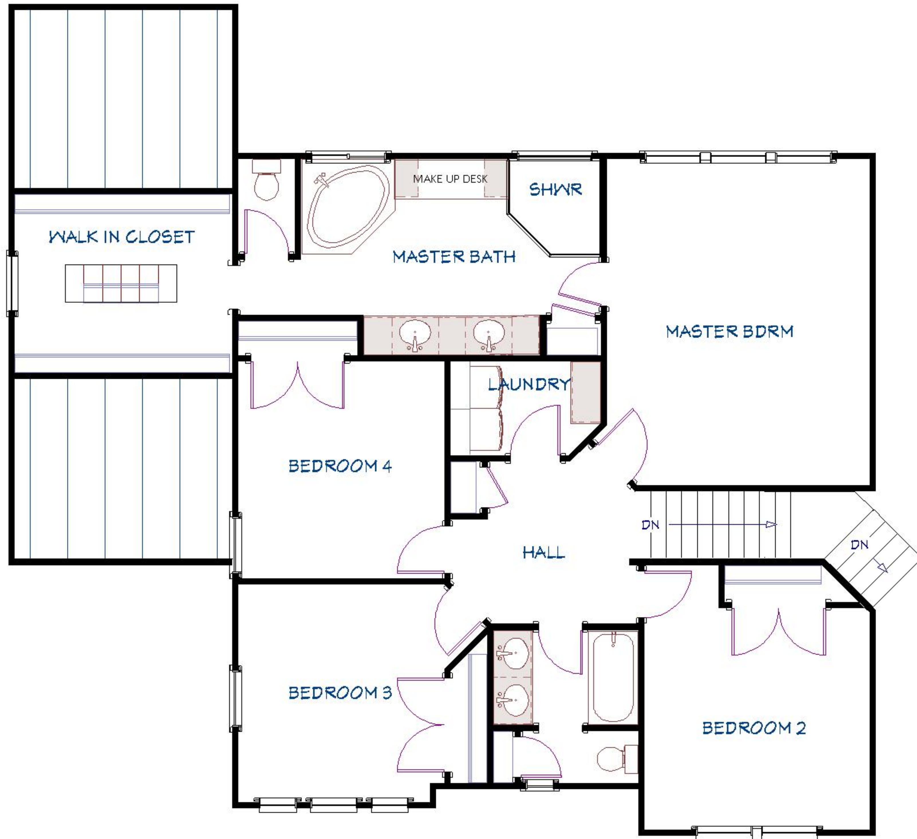
UPPER FLOOR 1335 SQUARE FEET