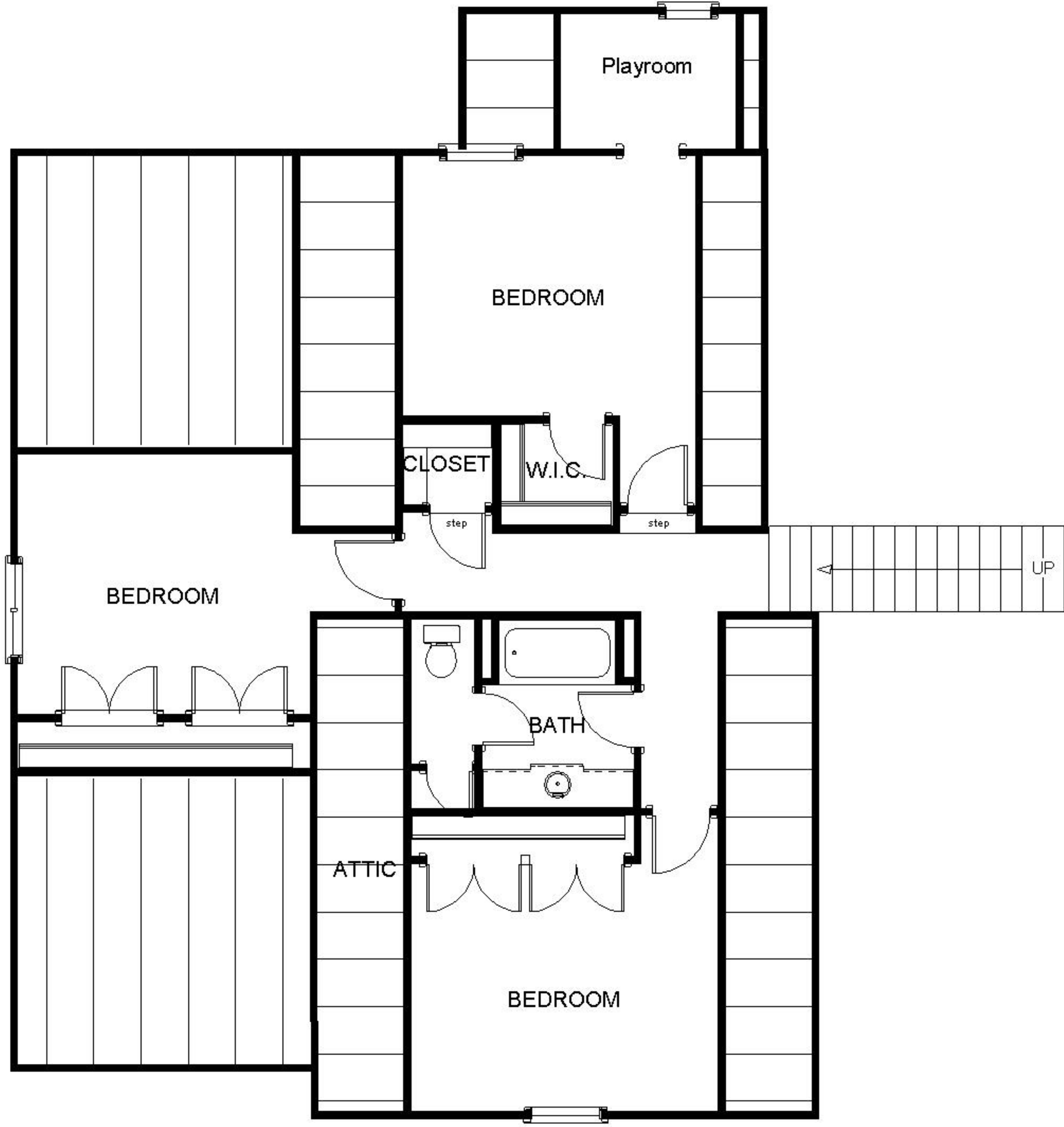
UPPER FLOOR PLAN 867 Square Feet