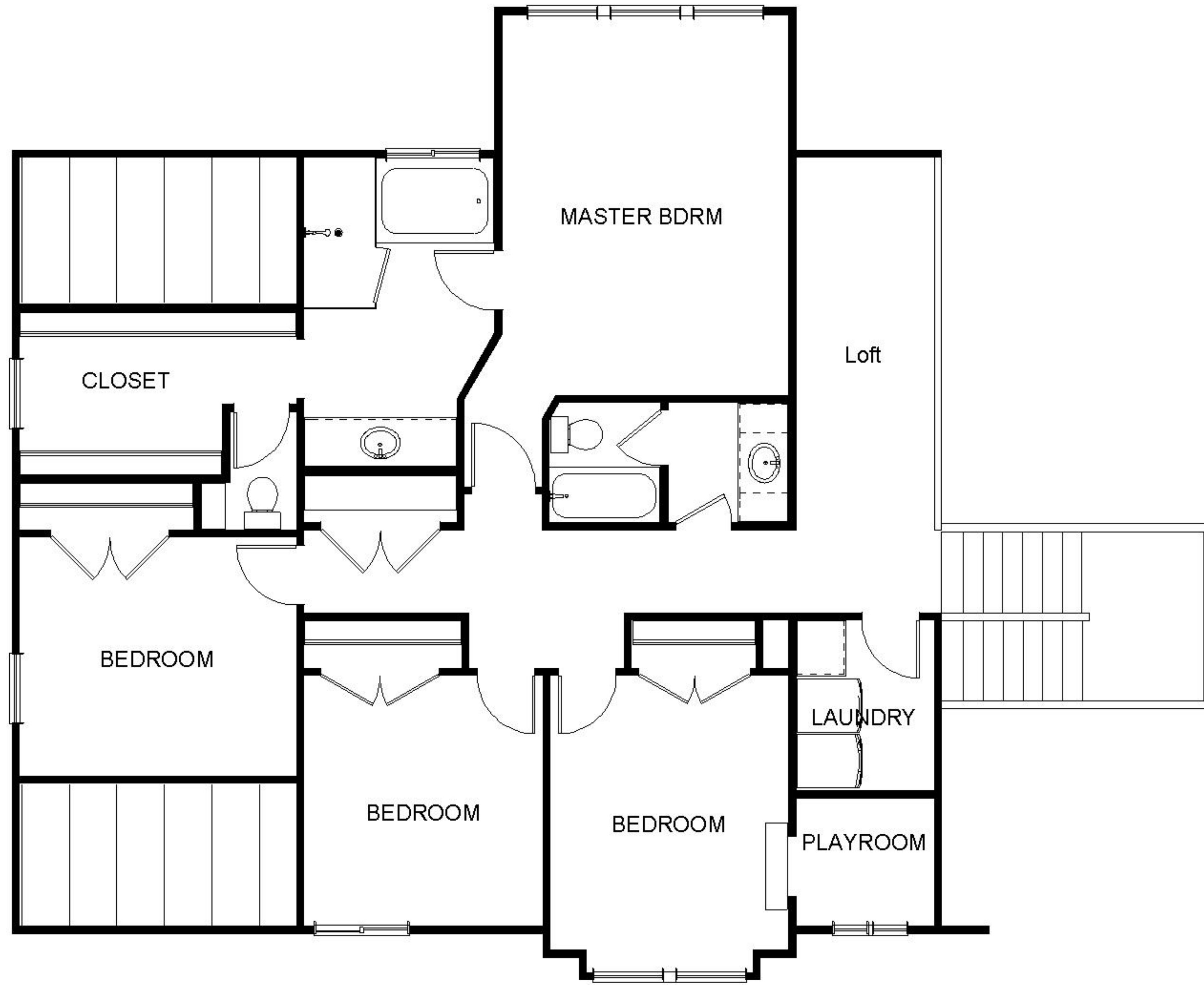
UPPER FLOOR PLAN 1234 Square Feet