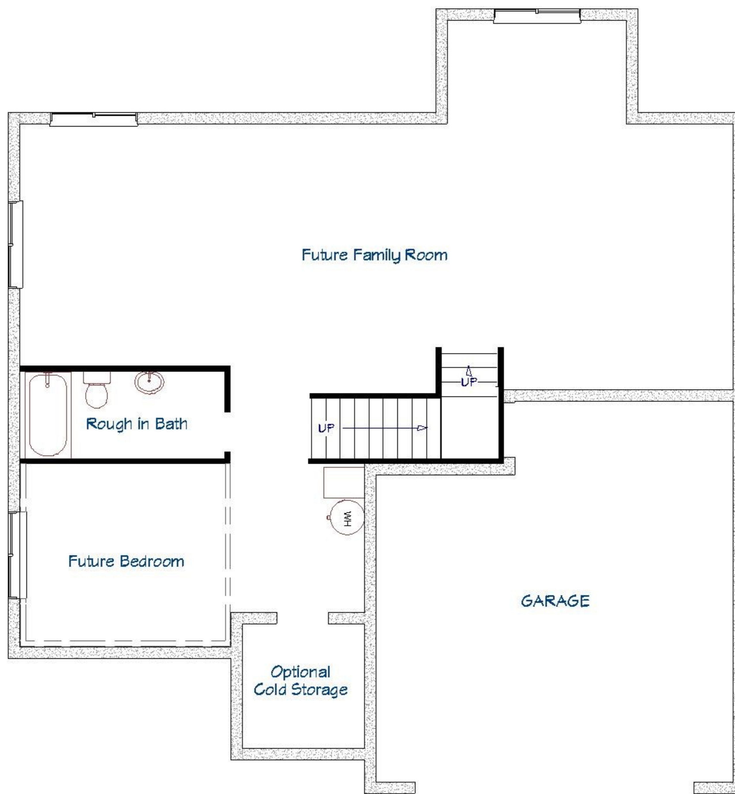
BASEMENT 1185 Square Feet