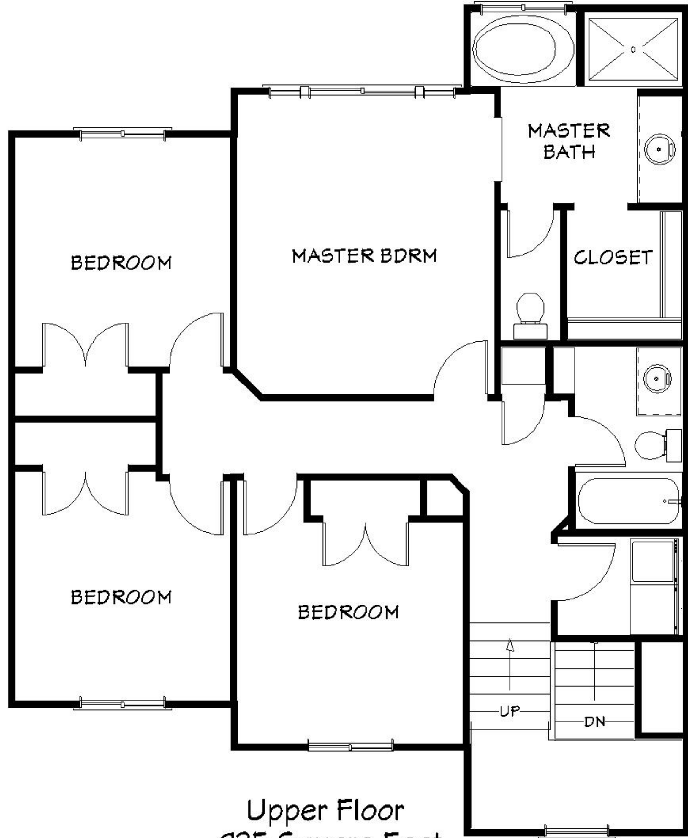
Upper Floor 935 Square Feet